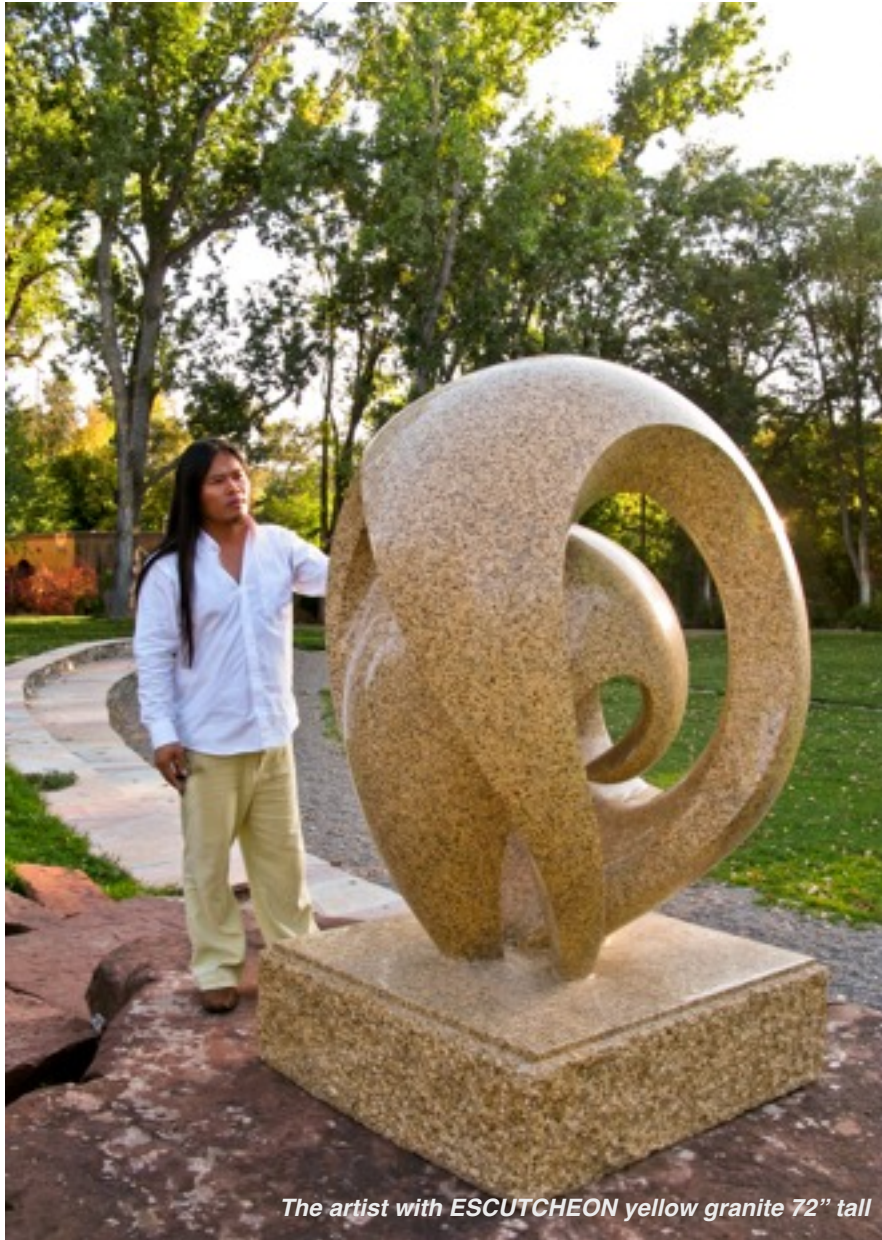
The artist with ESCUTCHEON yellow granite 72" tall