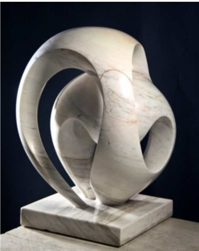
Top left: ESCUTCHEON yellow granite 72" tall below: ESCUTCHEON white marble 21" tall DANCE WITH WISDOM granite 57" tall

In early 2001 Khang built a studio at the base of a mountain near the ocean-side city of Nha Trang. In 2004 Khang moved this studio to Viet Nam, where most of the rock that he carves is quarried. Khang currently makes his home in Canada and in Vietnam.