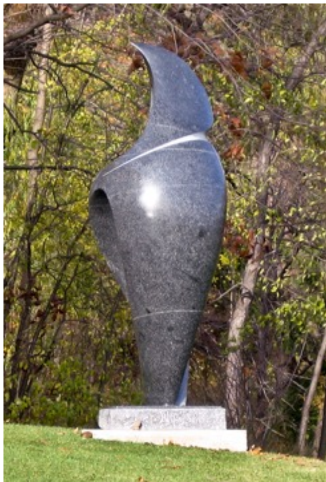
Top: SILHOUETTE EMBRACED granite 118” tall below: NIGHT granite 56” tall

“East Meets West, WE Artist Group Exhibition” John B. Aird Gallery, Toronto, Ontario, CANADA