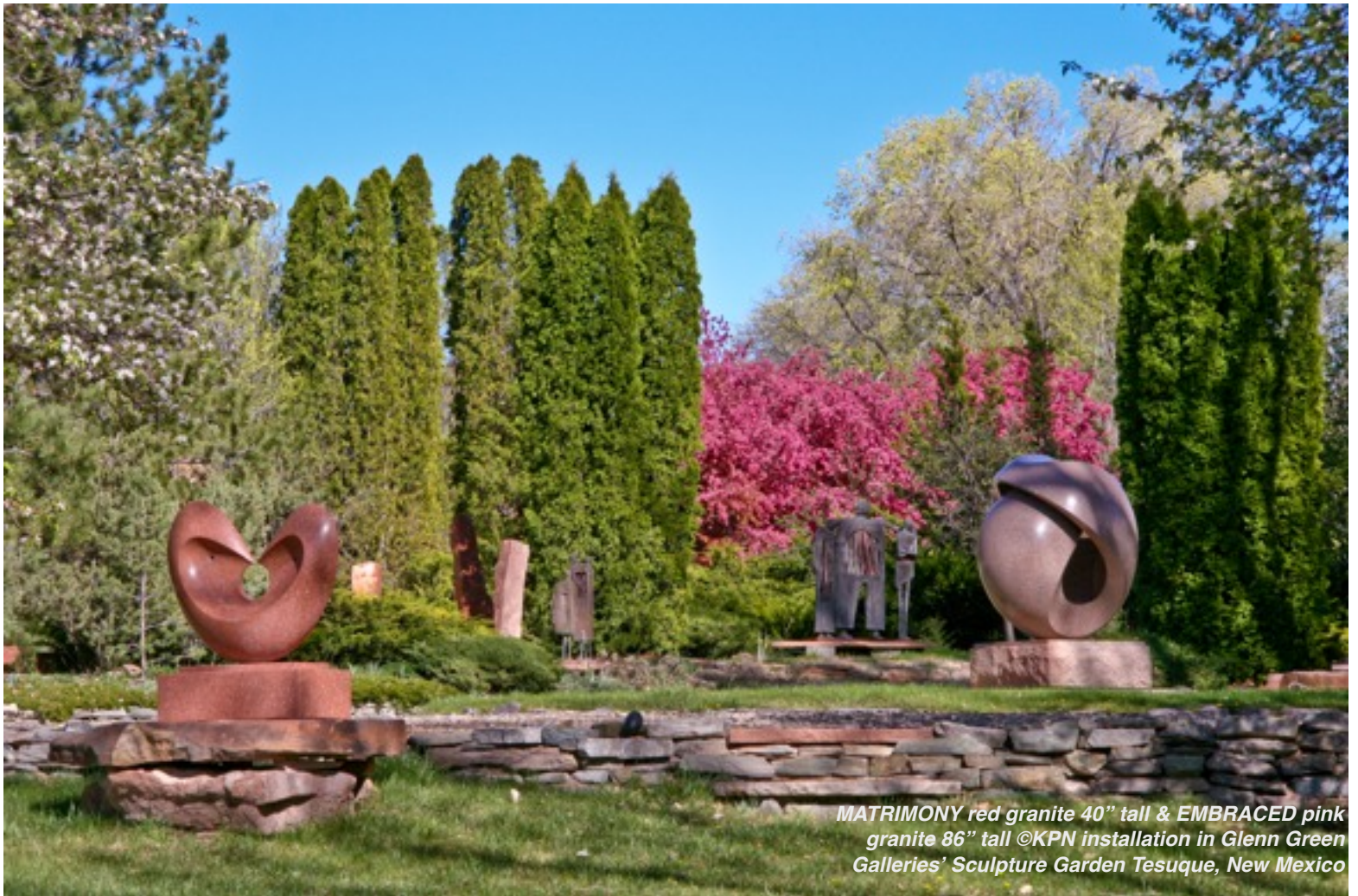
MATRIMONY red granite 40" tall & EMBRACED pink granite 86" tall ©KPN installation in Glenn Green Galleries' Sculpture Garden Tesuque, New Mexico